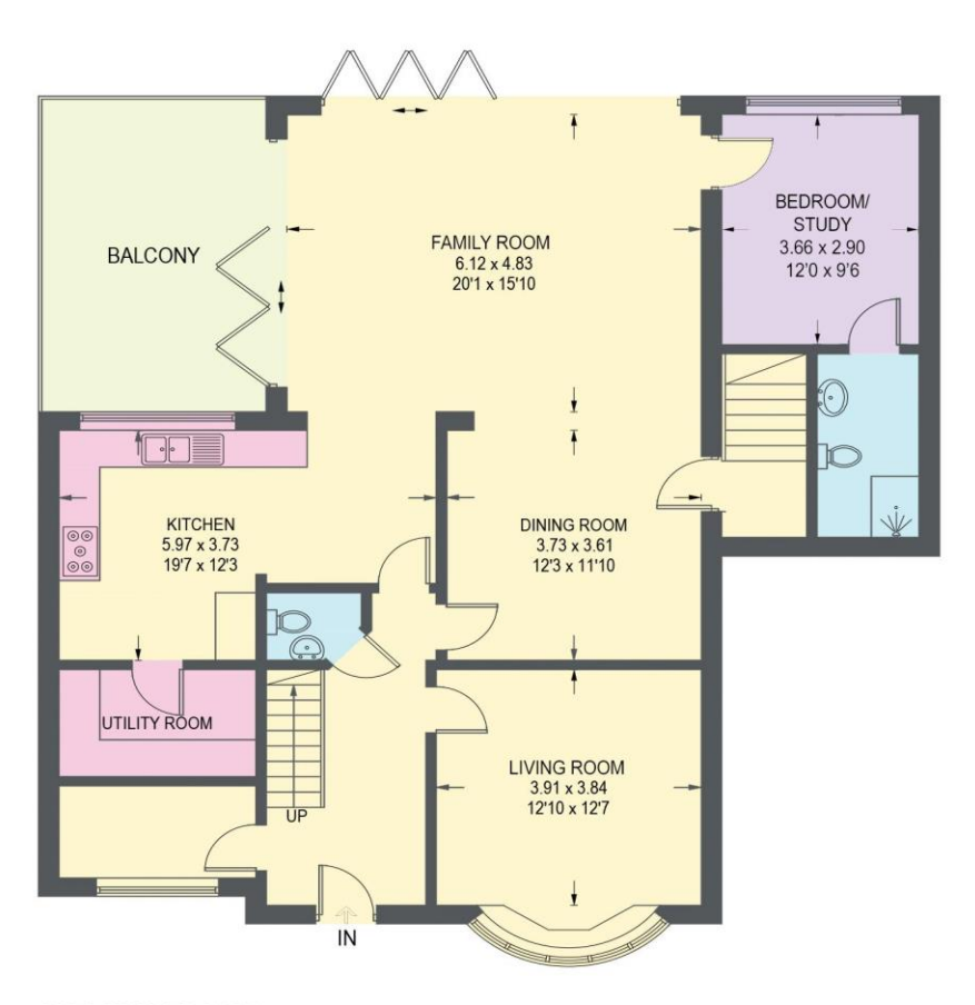
GROUND FLOOR 128.2 SQ M / 1380 SQ FT